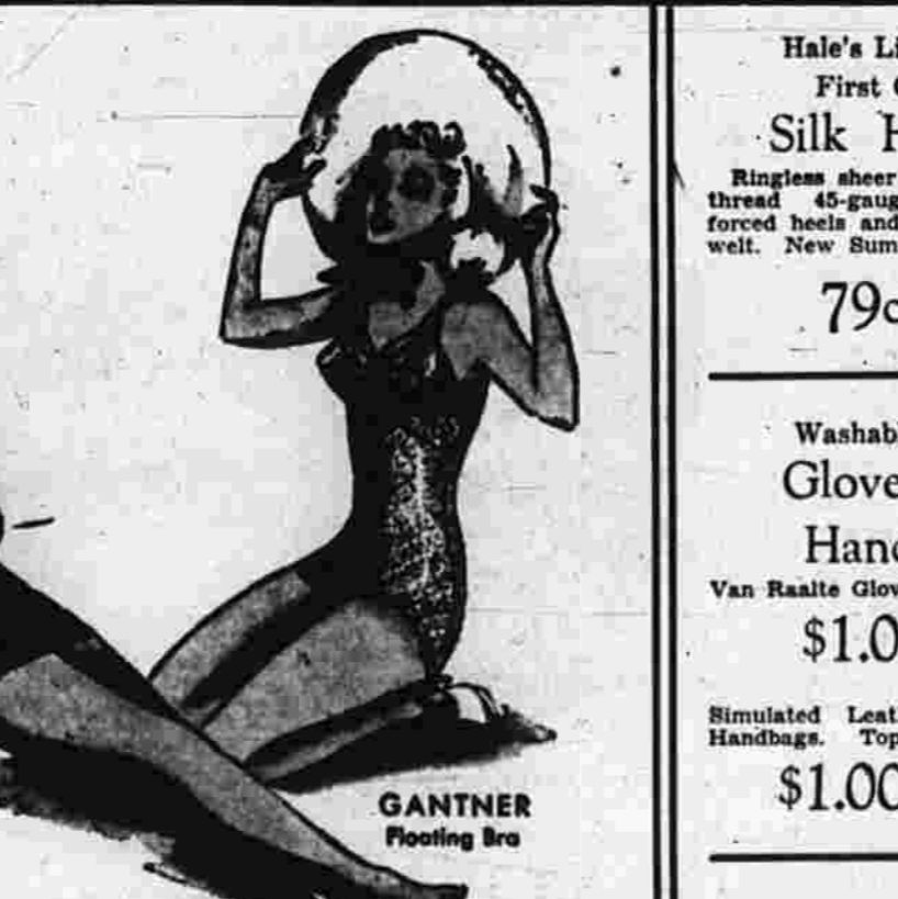
GANTNER Floating Bra

All this season's latest models in bathing suits for modern mermaids. Whether you swim or not you'll want a suit for sun bathing or lounging on the beach.