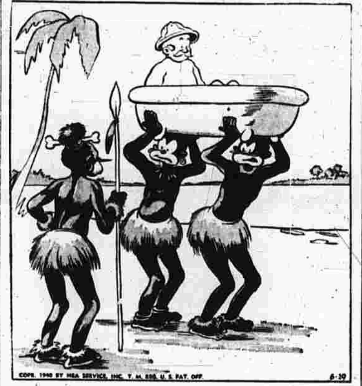
"He wants to tell his friends he bathed in the Congo, but he's afraid to try it without the tub."